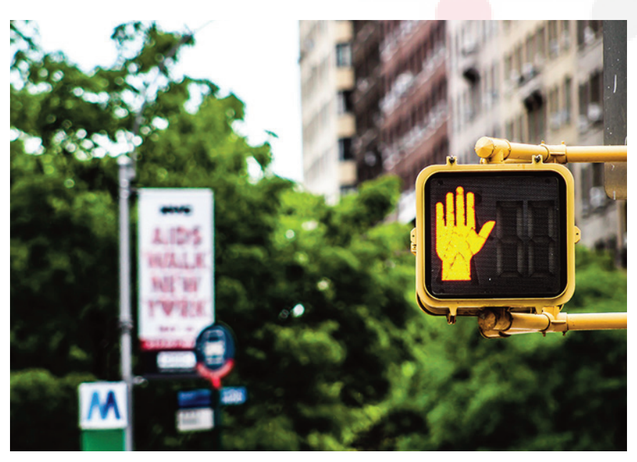
4 IPSI. Making Safety Standard.

When you're IPSI Certified, everyone knows.